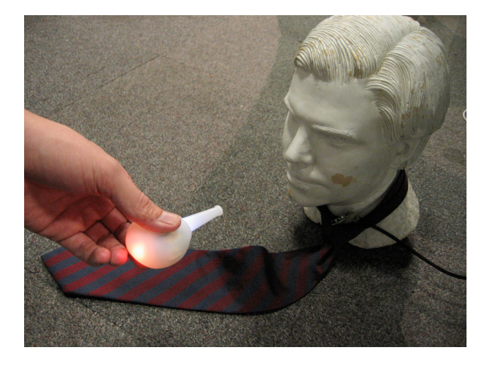
Figure 4. Slurp extracting a digital object from a sculpture.

In developing Slurp we realized it could also be used similarly to a USB drive or Pick-and-drop [17] for moving files directly from one screen to another. In the smart-office scenario it is common for workers to use digital whiteboards, large shared displays, PDAs, smartphones, laptops, PCs, and audio systems collaboratively and concurrently. The problem of how to move and share data objects across these displays has been well studied [15, 17]. In a detailed study comparing techniques for multi-display reaching by Nacenta et al. [15] the authors found that systems with local feedback, 1-to-1 mapping between digital and