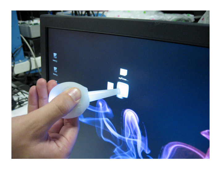
Figure 5. Slurp injecting a digital object onto a screen.